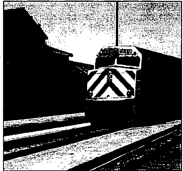
Caltrain engine at Salinas Station