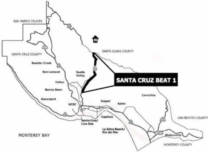
FIGURE 1: Map of Santa Cruz Beat 1