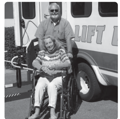
Measure J will provide $23 million for new specialized transportation services for seniors and disabled people