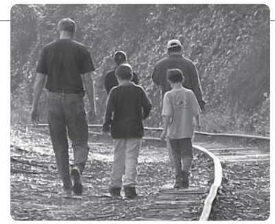
A coastal rail/trail next to the railroad tracks from Davenport to Watsonville will receive $23 million from Measure J