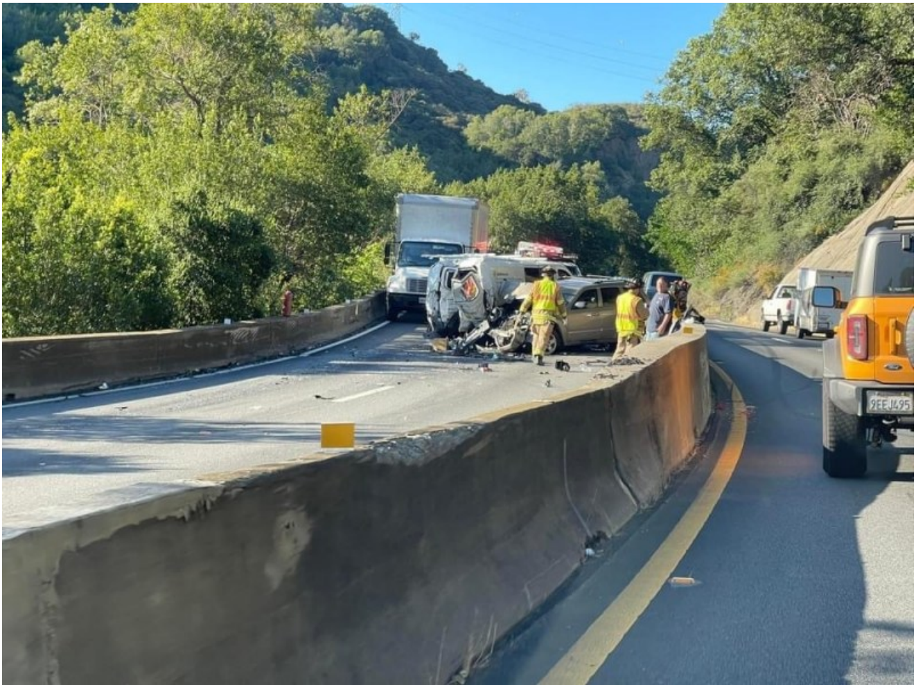
Friday's crash blocked northbound Highway 17 for several hours on Friday morning.

A Mercury News report said that the bus had run into standstill traffic on its way to San Jose, and could not stop in time, causing it to collide with six other vehicles. It also said that the bus had been towed and the remaining passengers were picked up by 11:26 a.m.